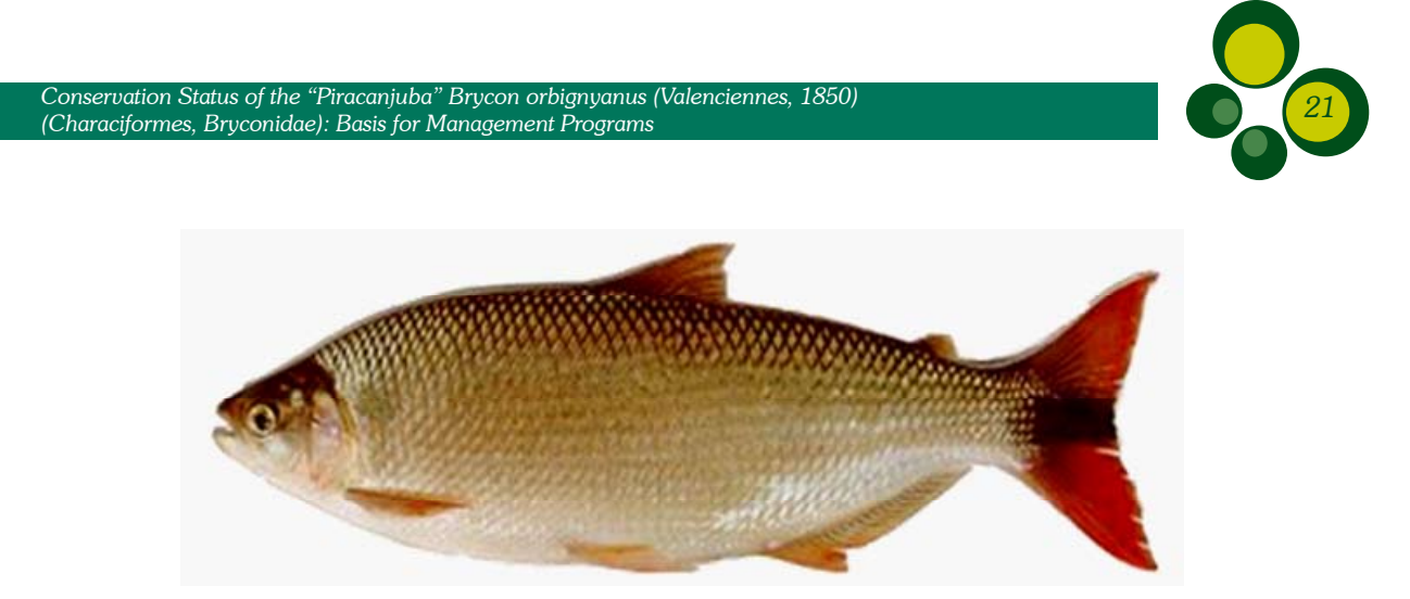
Figure 1 – Brycon orbignyanus (Valenciennes, 1850), 33 cm SL.

The "piracanjuba" is a species that performs trophic and reproductive migrations (Lima et al. 2003). Its omnivorous habit, being of preference for fruits and seeds during the period of floods and crustaceans and small fish during periods of drought, gives the species enormous capacity for digestion and assimilation of proteins of plant origin (Ceccarelli et al. 2005). Due to the great capacity of migration, B. orbignyanus lives preferably in stretches with continuous water flow, being characterized as a rheophilic species (Lima et al. 2003). The reproductive migration generally occurs during the flooding river station in the period from September until January (Godoy 1975).